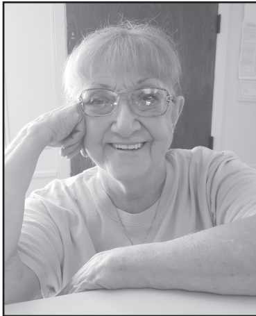
By Sue Reich

Takin' a short break... Don't go anywhere! Hope to be back soon!