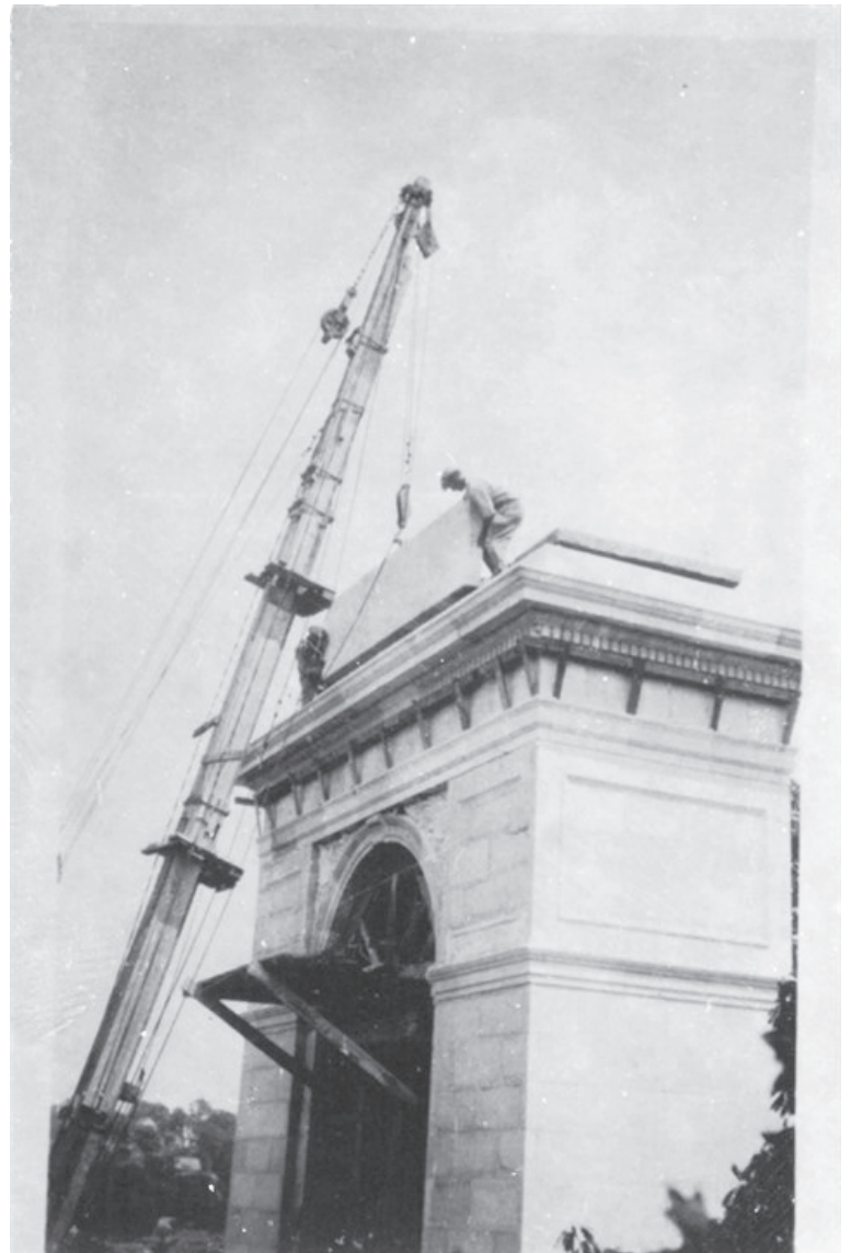
Exhibit provided by the Wyandotte County Museum in partnership with the Rosedale Development Association.

This exhibit will be on display at the Wyandotte County Museum from March 12-May 31st. It will then be displayed at the Rosedale Development Association, dates to announced.