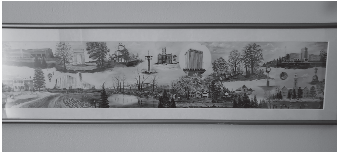
This is a copy of the mural that Arlie painted in the City Hall of Kansas City, Kansas.

Well, dear readers, guess I will sign off. Please be kind, lvyaa all. You little old gal from Argentine. Sue Bless you all!