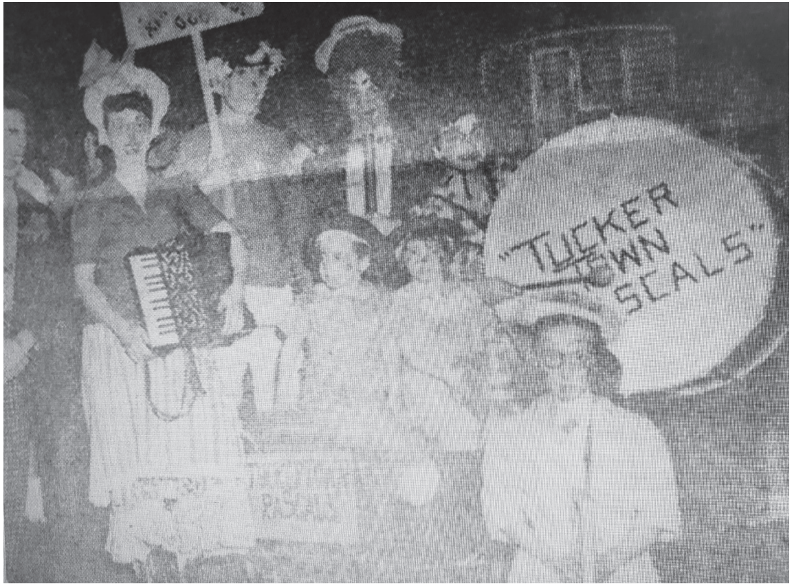
Tuckertown Rascals in an evening parade in Argentine.