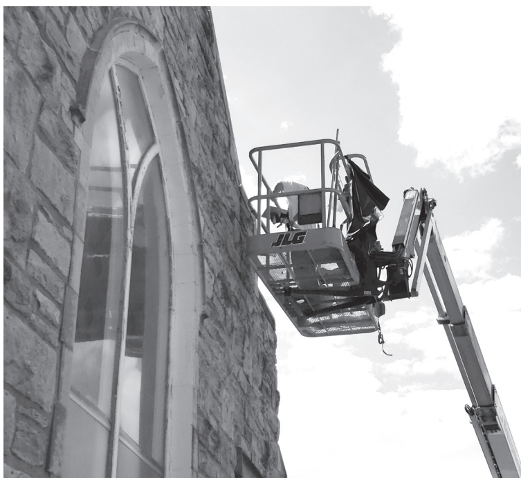
First Baptist church of Turner was due for a touch-up. Hope it wasn't hot that day.