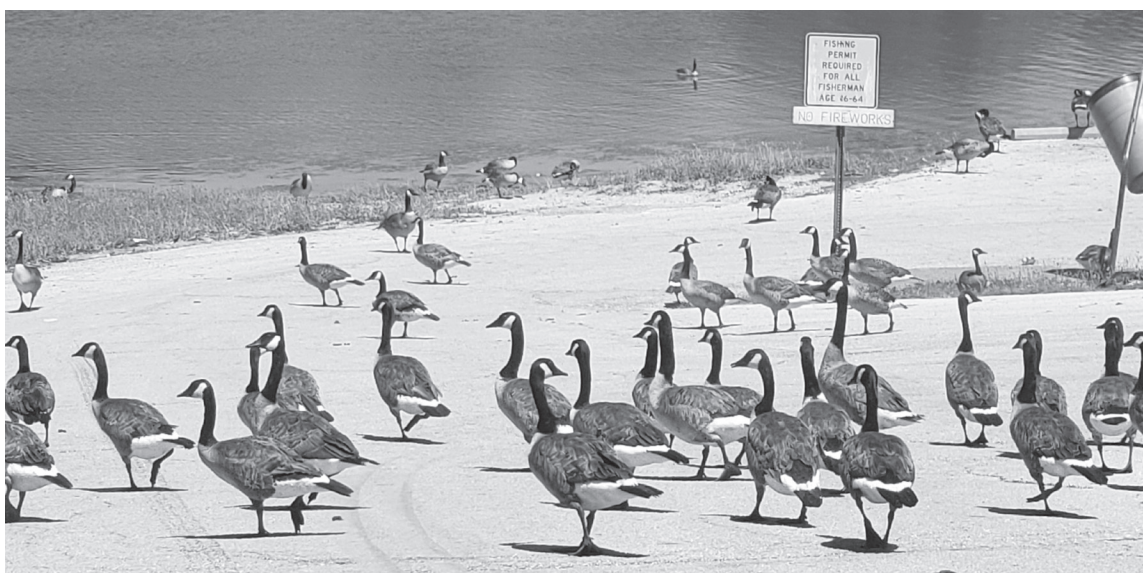
These Geese were having a hey-day blocking the road in Pierson Park.