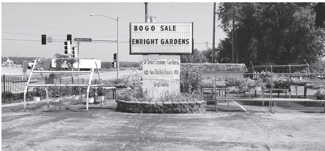
The Community Garden in Turner is having a great sale. Stop by and buy.

Your little ol' gal from Argentine/ Turner, Sue