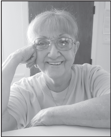
By Sue Reich

I was reading goofy stuff on Facebook; haunted houses, UFO's, and all kinds of weird things. Some people believe in that stuff, then there are skeptics.