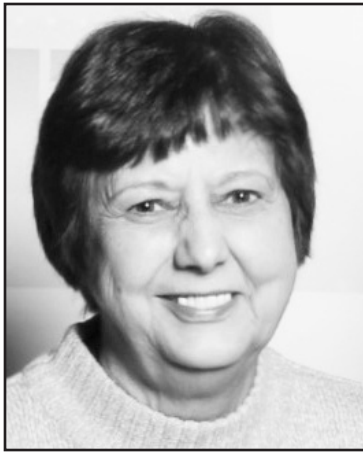
By Sharon Hoover

Sixteen years ago, while on vacation in Atlanta, we went to the Underground Atlanta Shopping Mall across from the Coca Cola Museum. One of the rooms contained an exhibit of Underground Railroad Code Quilts. No brochures or anyone was available to explain the meaning of the patterns, but we found them interesting.