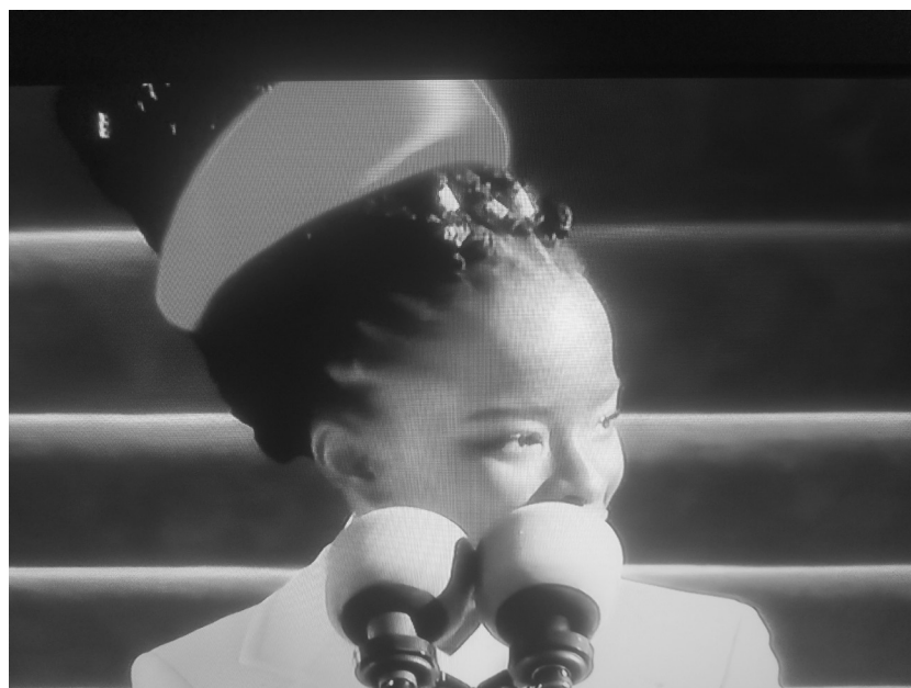
Amanda Gorman, age 22, official Inaugural Laureate, reminded American what poetry can do.