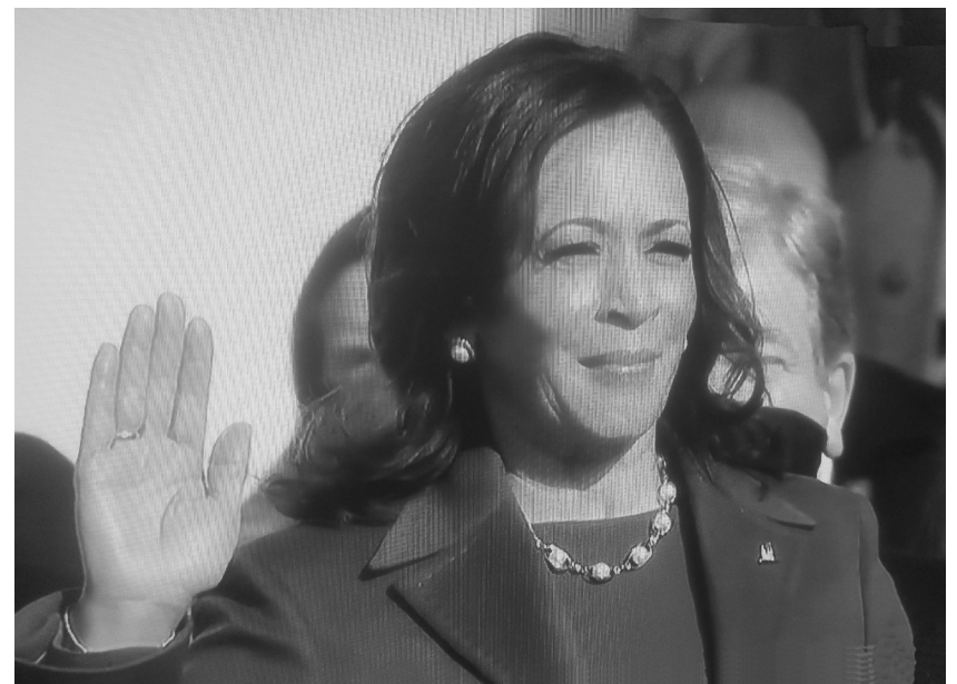
Madam Vice President-elect taking her oath on two bibles.