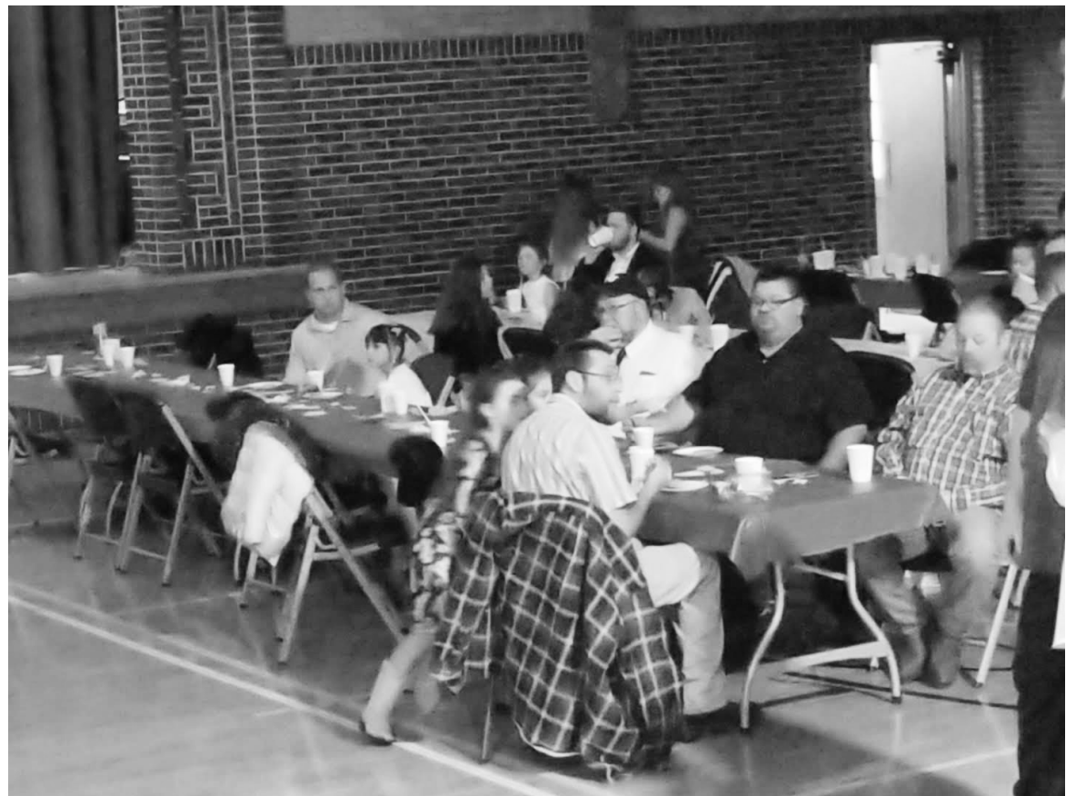
We used to get together and enjoy ourselves at TRC.