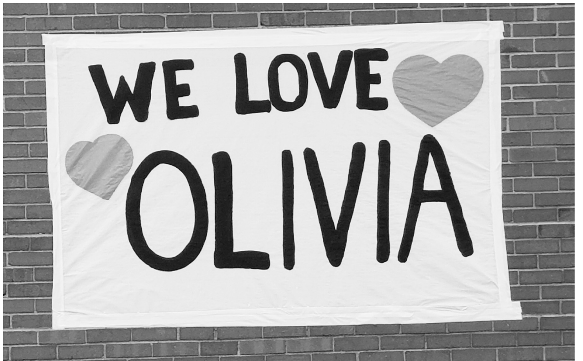
We Still Love Olivia