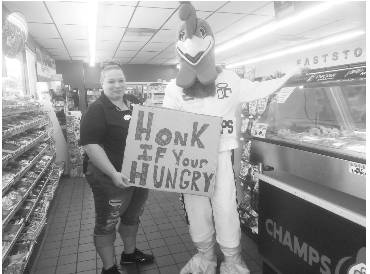
Yes, we are hungry. Love that chicken.

Rosedalians of all ages gave back to their neighborhood by organizing a pick up trash day in April and May. They went around most neighborhoods and picking up litter, cutting honeysuckle and weeds. They cleared the storm water system from litter which helps protect it and keeps the neighborhood beautiful. Picking up litter is a concrete thing that is good for community health and safety. Thank you to all the people that helped in this project. For more info on forming your organization this fall, contact: Juanise Oliver at: juanise@rosedale.com