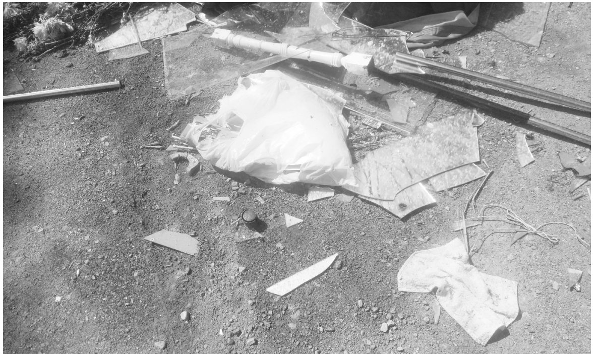
I see the trash has been picked up. BUT---for how long? Where are those "no dumping" signs?