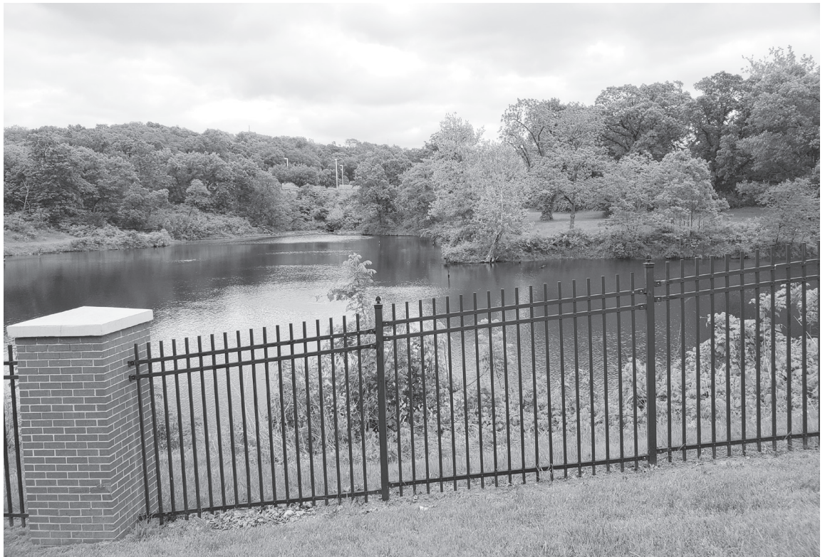
This is the pond at Turner High School. It has quite a story.