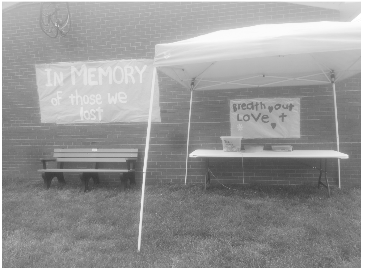
Pen & paper is set out to write a name and/or message for those who are no longer with us.