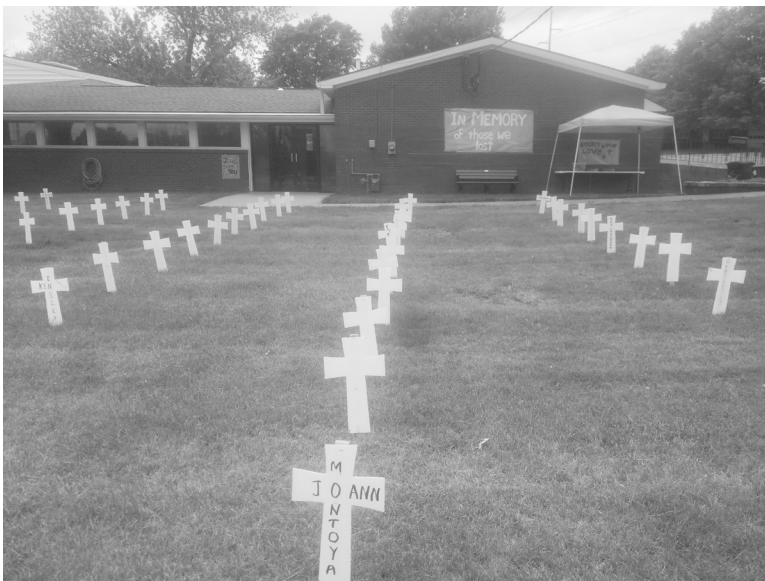
Beautiful crosses at a local church.