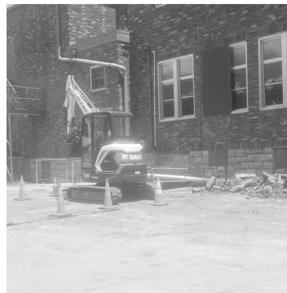
The back of old Junction Grade School in Turner. All ready for some work this summer.