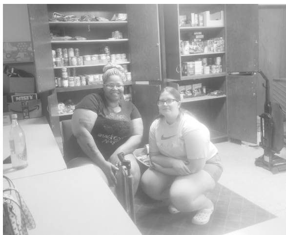
The two lovely ladies are working the food pantry at the First Baptist Church. By the way, the pantry really needs more donations due to the pandemic situation. They have clothes and food for those in need.