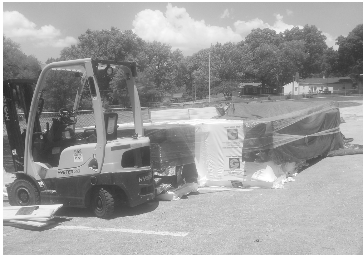
Behind old Junction Grade School.