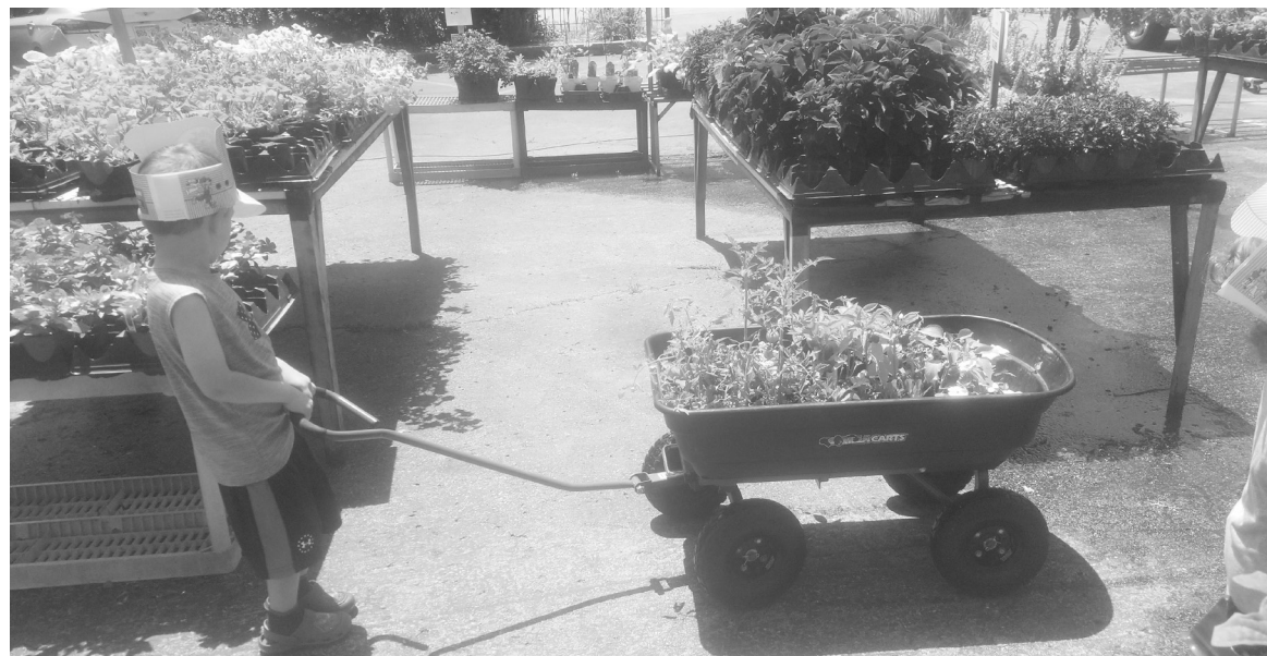
Little tyke pulling a wagon of plants for mommy. It is located at 55th and Klamm in Turner.