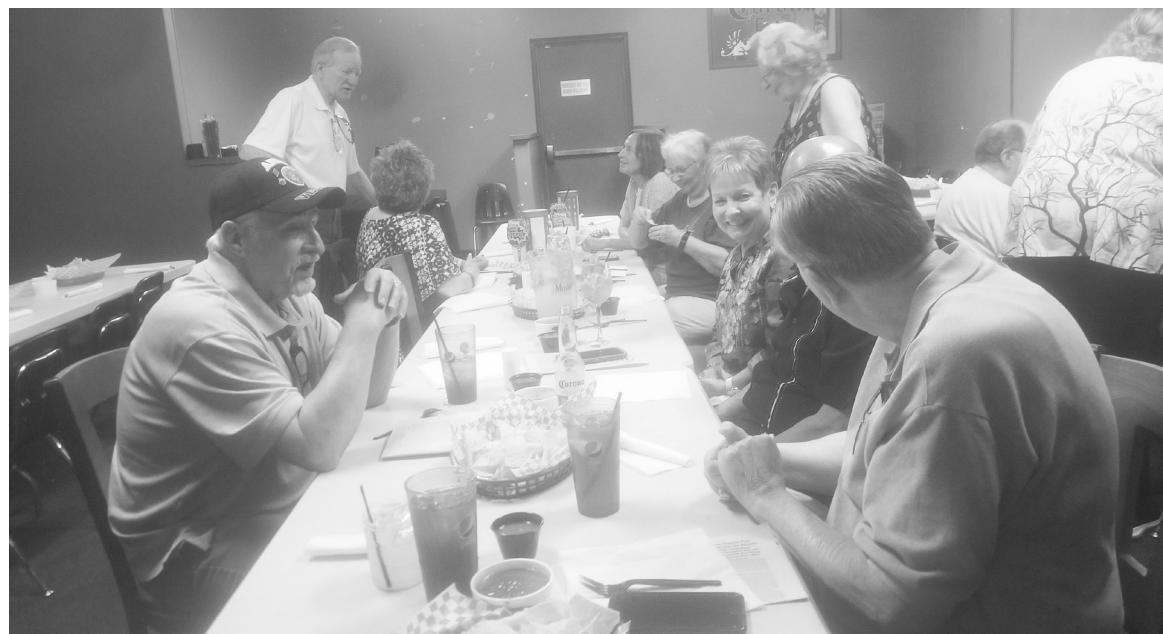
The group from Turner & Argentine finally got together after a year and a half.