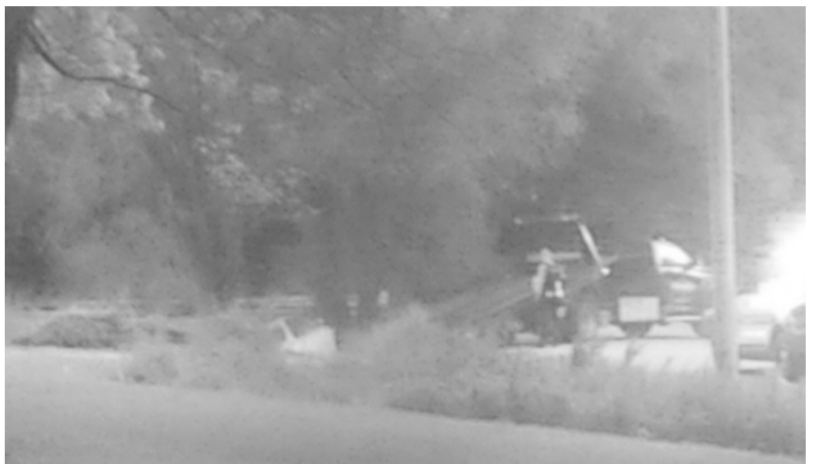
Car went in a ditch backwards on the corner of 73 rd and Holliday Drive.