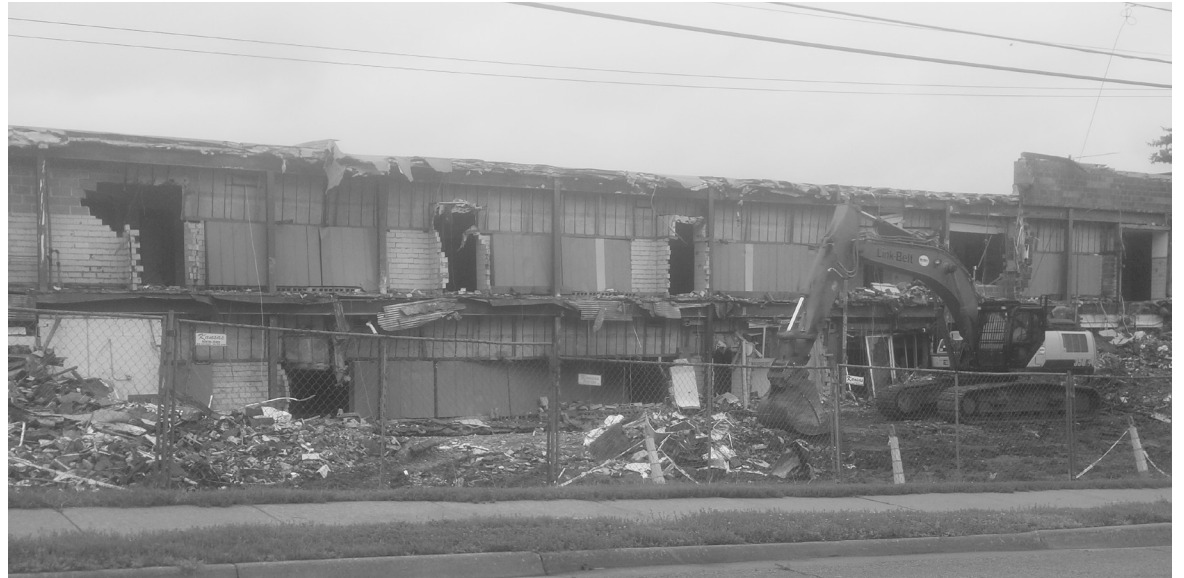
More of Turner school coming down. The rain stopped no one from doing their job.

The Turner Middle School building is on track for the beginning of the 21-22 school year. Final details are being completed over the next couple of months and the new furniture will be moved in during the month of July. It will be exciting to see the students learning in this new facility come August.