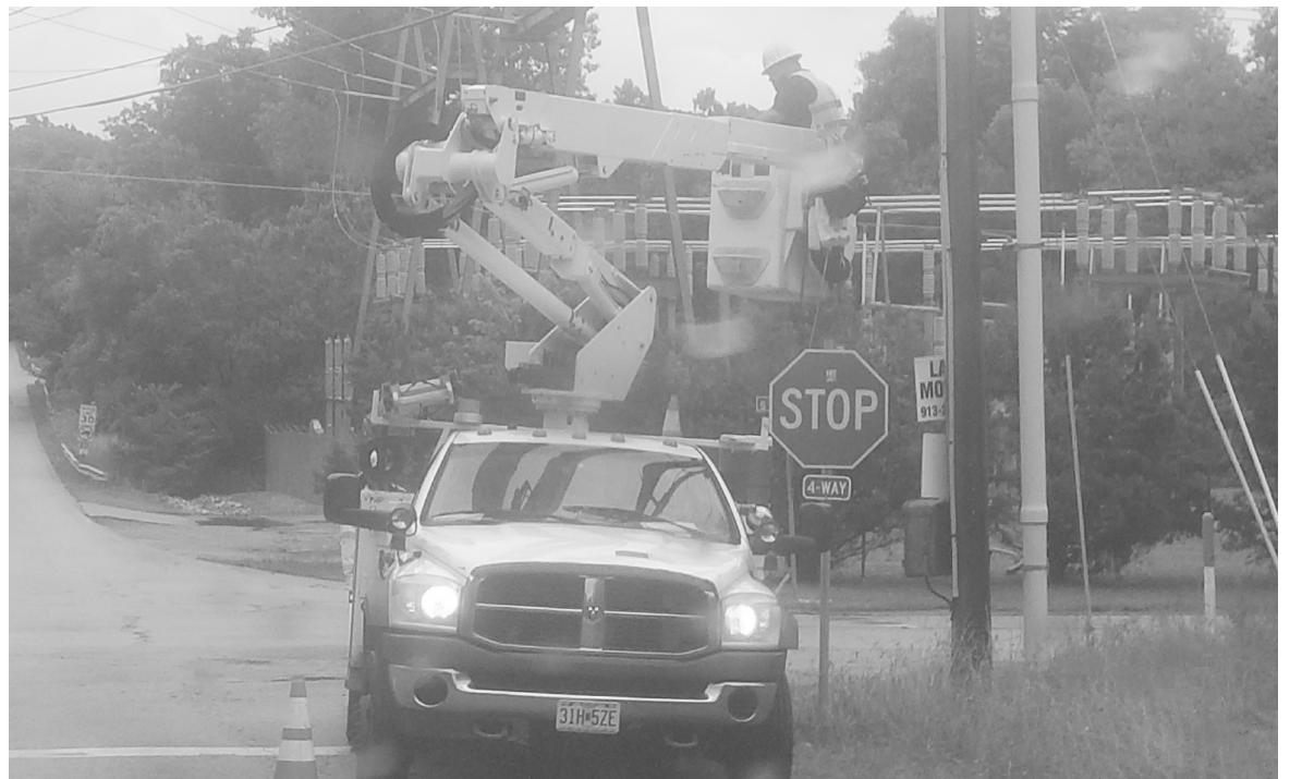
Two fellas doing their job, rain or no rain at 59th Street and Metropolitan.