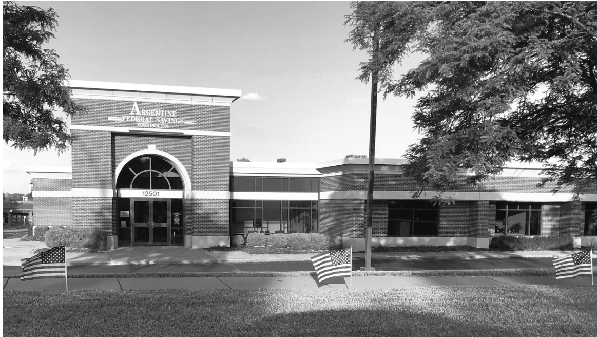
Argentine Federal Savings celebrated the days leading up to July 4th, Independence Day, with many flags decorating the front of their building and sidewalk at their location at 125th and Antioch.