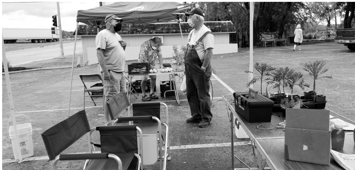
An outdoor market was held in the parking lot next to the community garden.

This poem hit home with me, and I am sure with a lot of people who are going through tough times during this pandemic. Seems like we are in a Twilight Zone or something and when things start to happen out of the ordinary, we need an inspirational poem like this to help us through. Keep it, read it. Hope it will get you back in balance and you will sail through the negatives of life.