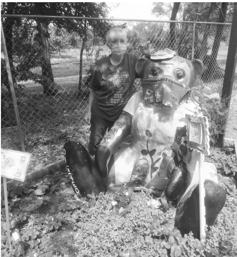
Take a good look at DIGGER. He is going to undergo a big change this year.