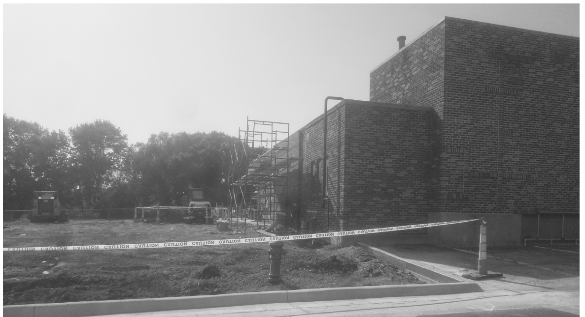
Half of old Junction grade school is down.