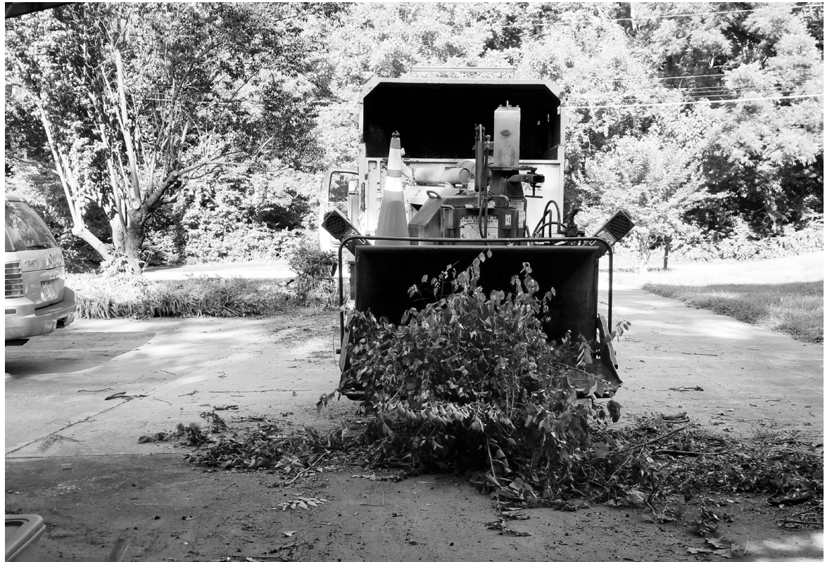
Our yard had really got out of hand. Professionals had to clear it out. t's a jungle out there.