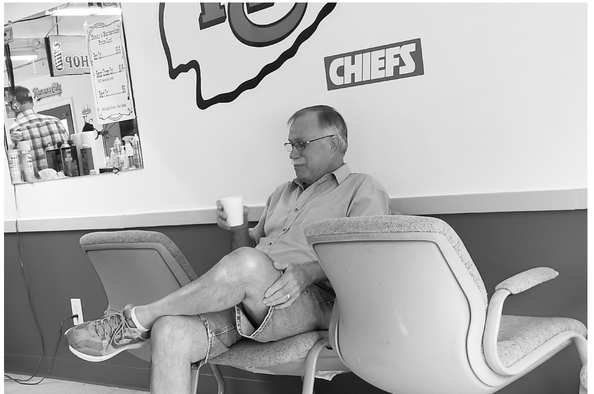
Customer waiting at Denny's barbershop, on Maple hill.