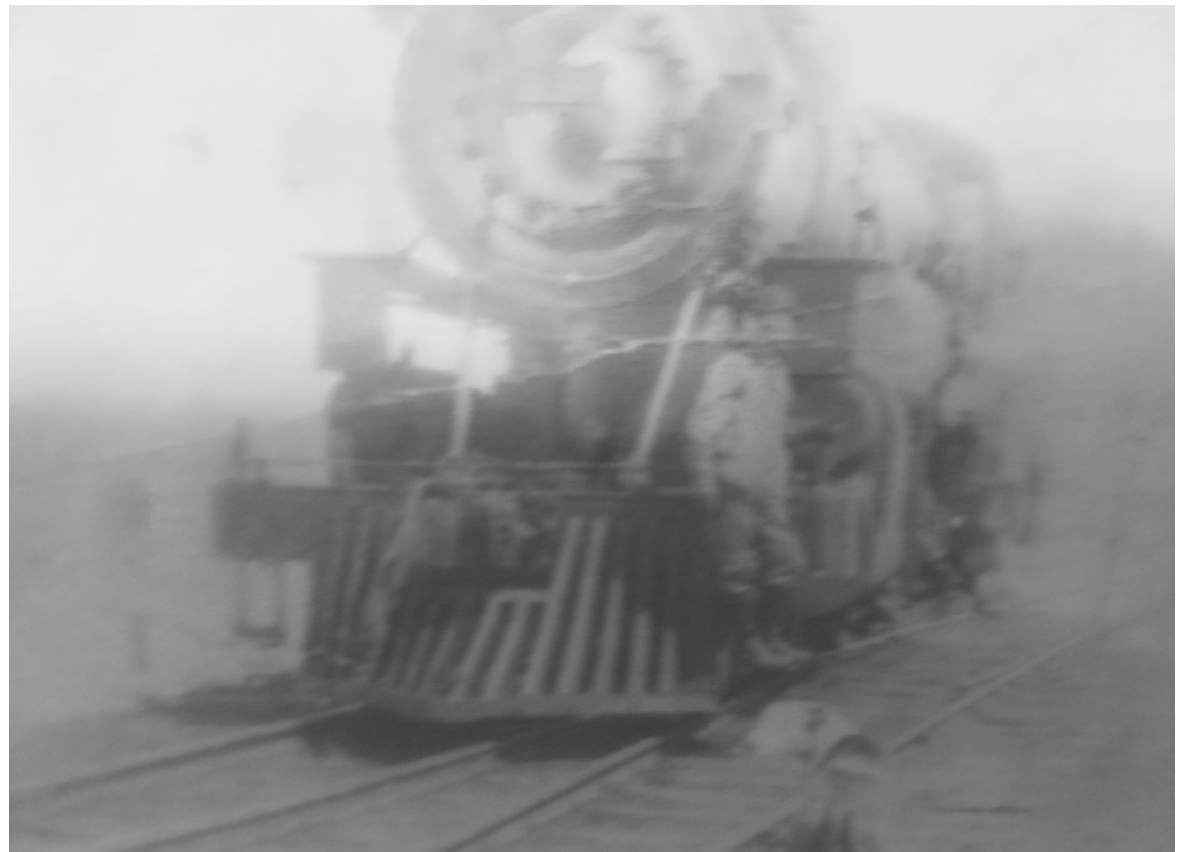
My Grandad was an engineer and would pass our house in the 40's. We would wave and he would "toot."