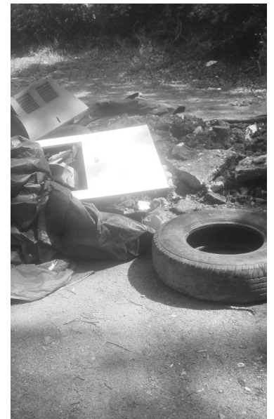
Let's catch the rascals doing this.