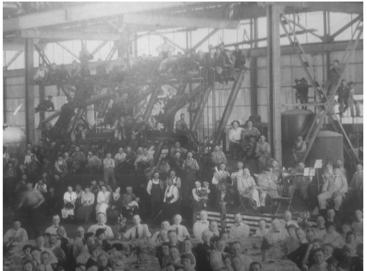
Very old picture of KCK structural steel plant.