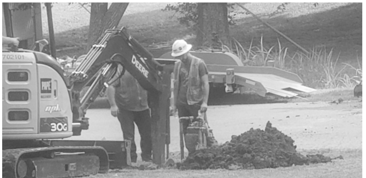
The large pile of dirt is where the old meter was.