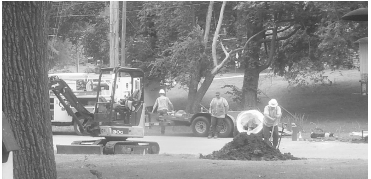
These men are working diligently on the street. They are going to put in a new meter further away from the street.

before he got on the show, he had murdered four women within a week or two. His name was Rodney Alcala. He was a serial killer that had been hunted for killing and assaulting six women and one girl. He started that in the 70's. He died on July 24, 2021 and was 77 years old. The lady that decided not to date him after all, saved her own life. She had a feeling and followed through with that feeling. She was one of the lucky ones.