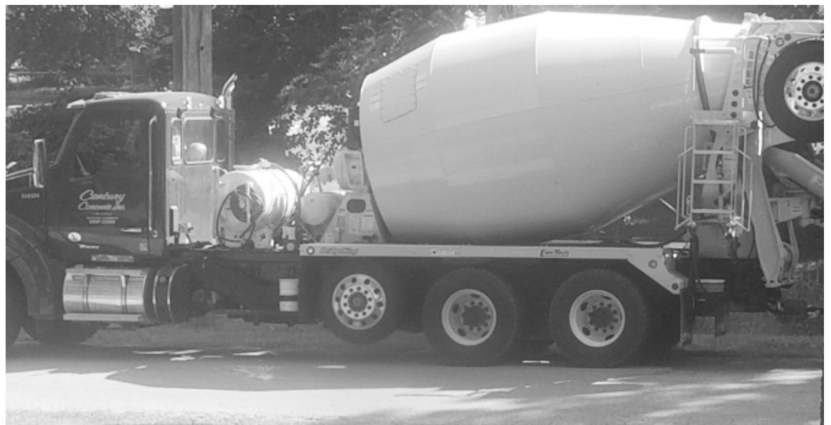
This big cement mixer truck was in front of our house repairing the street where a large hole had been dug by a bulldozer.