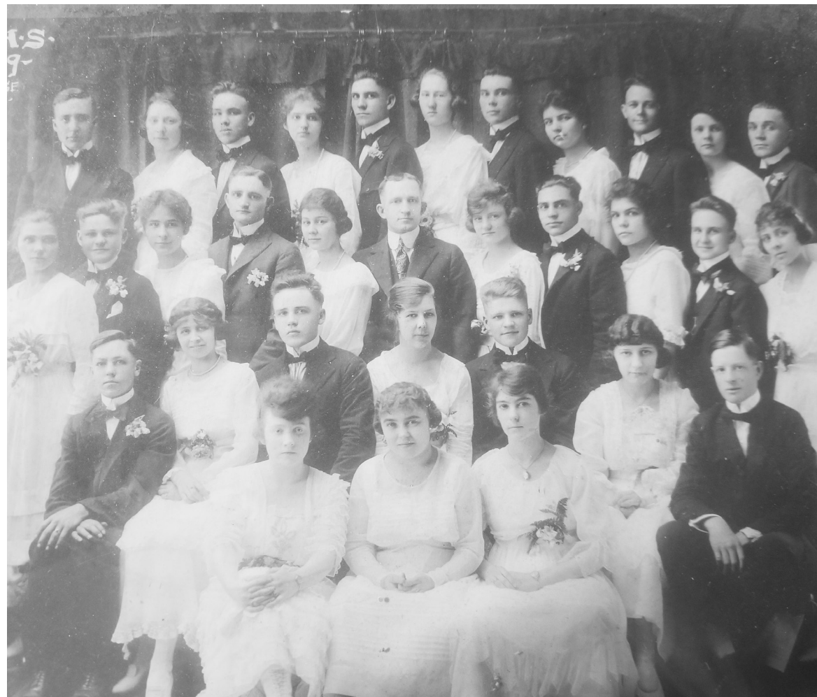
This is one of the first pictures of an Argentine High School senior class. It was taken in 1919. Over 100 years ago. Sharp looking group, aren't they? Recognize anyone?