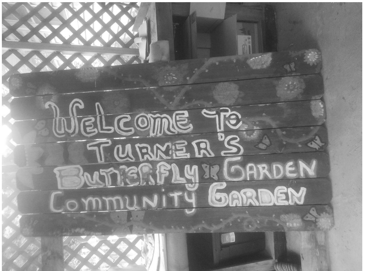
This is the old sign that was in Turner's Community Garden. It stood about 10 years or so. It has since been brightly repainted.