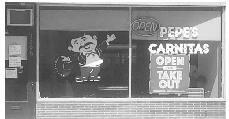
Carnita's is open most of the time in spite of the virus. It does take-out business.