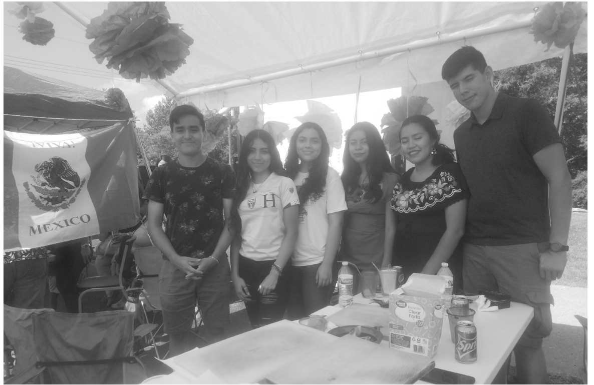
This wonderful Youth Group, and many others had a fair in the M.I.Christo Te AMA parking lot. There were several booths representing different countries such as: Mexico, Ecuador, Brazil, and many more.