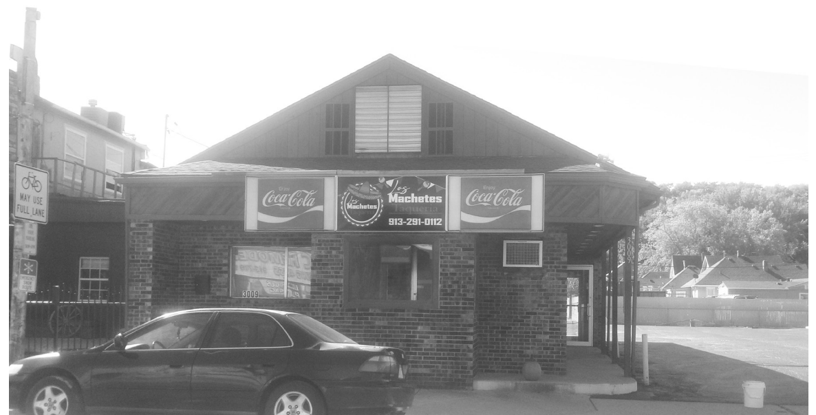
After "Wolfies" closed, which most of the people of Argentine enjoyed, it became a Mexican food place, then it closed. Another short-lived eating place couldn't survive. Probably because of Covid-19. Now another proprietor, Machetes, is going in now. Hope they can make it.