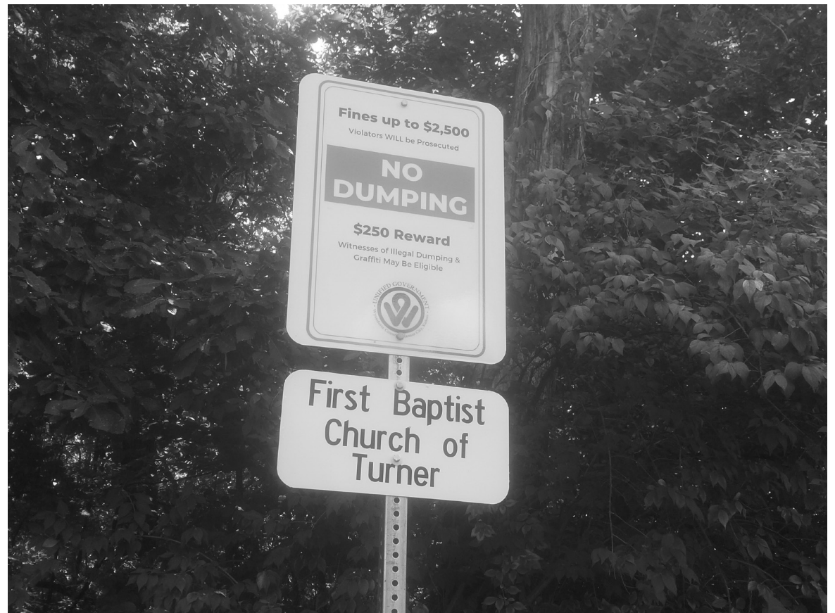
FINALLY!! Thank you to the First Baptist Church of Turner.