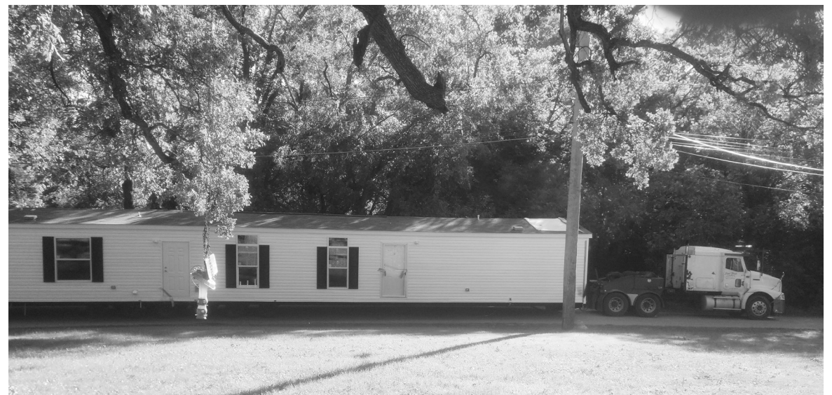
A long long trailer is being pulled up to the mobile home park, Quivira Estates above Morris. About 10 new trailers are being put above Morris.