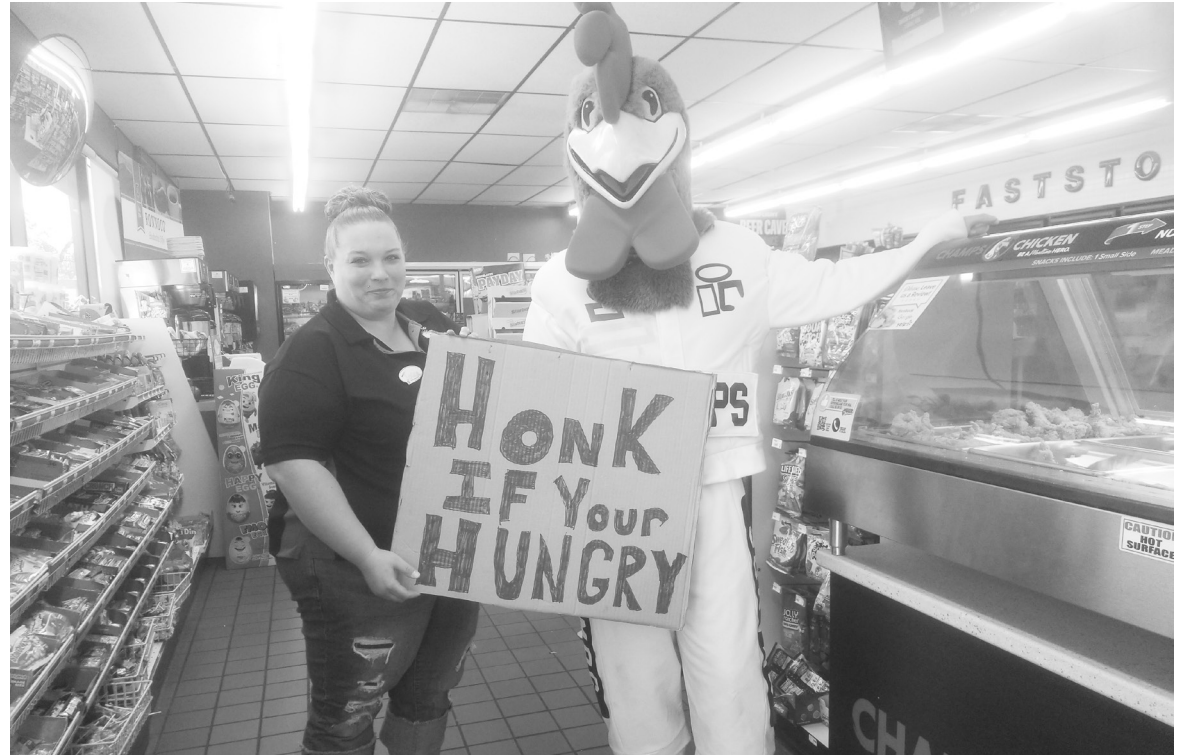
An old rooster and his sassy chicken. BP serves a lot of chicken and other goodies. Their sign reads, "Honk if you're hungry. Aren't they cute?"

nice, if it rains or too cold, we will go into the newly purchased building next door. Remember, October 14th on a Wednesday at noonish. No guns, dope, booze allowed. lol. Put this on your calendar/planner.