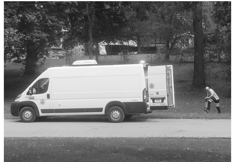
UG employees working on s. 73rd street. At least some people are still working.