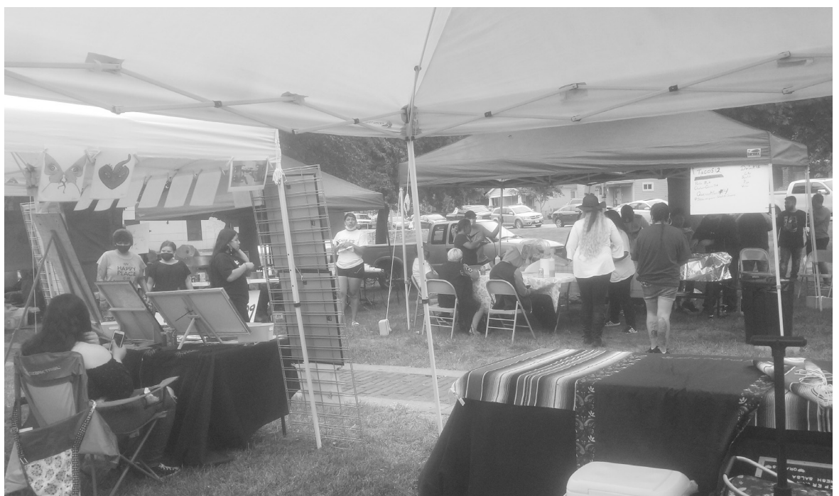
Silver City Days was still celebrated in spite of the pandemic. But music was still played, and good food was served.