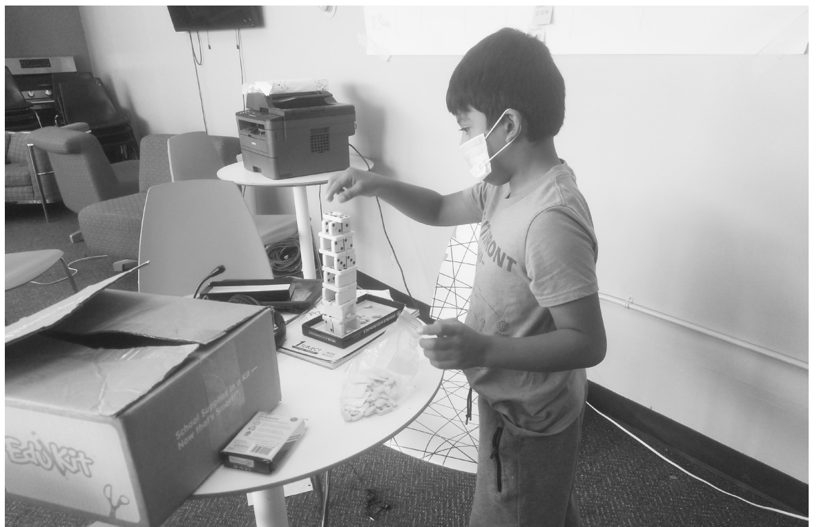
Little fella building a tower out of dominoes.