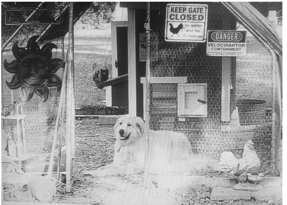
Cammy keeping guard on the chickens.