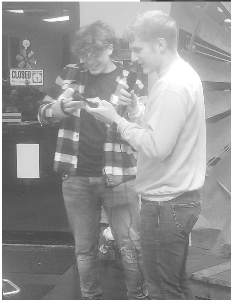
Two fellas trying to "get their act together" at WindmillKC