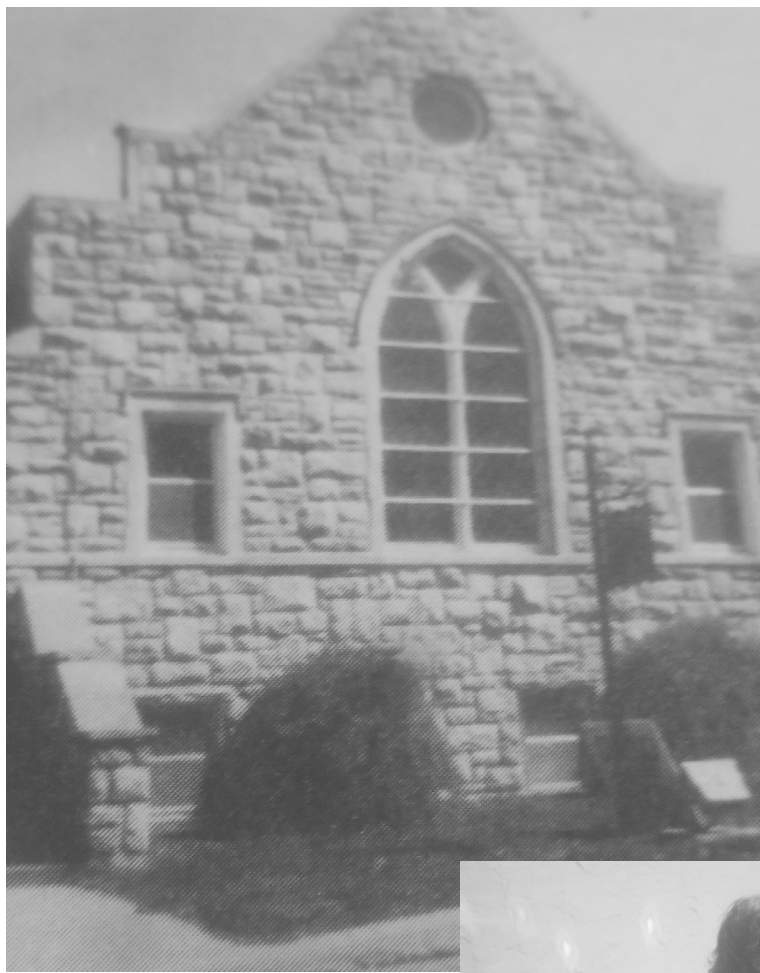
This is an old picture of Turner Baptist Church

Apples of Gold: We can do anything we want if we stick to it long enough.