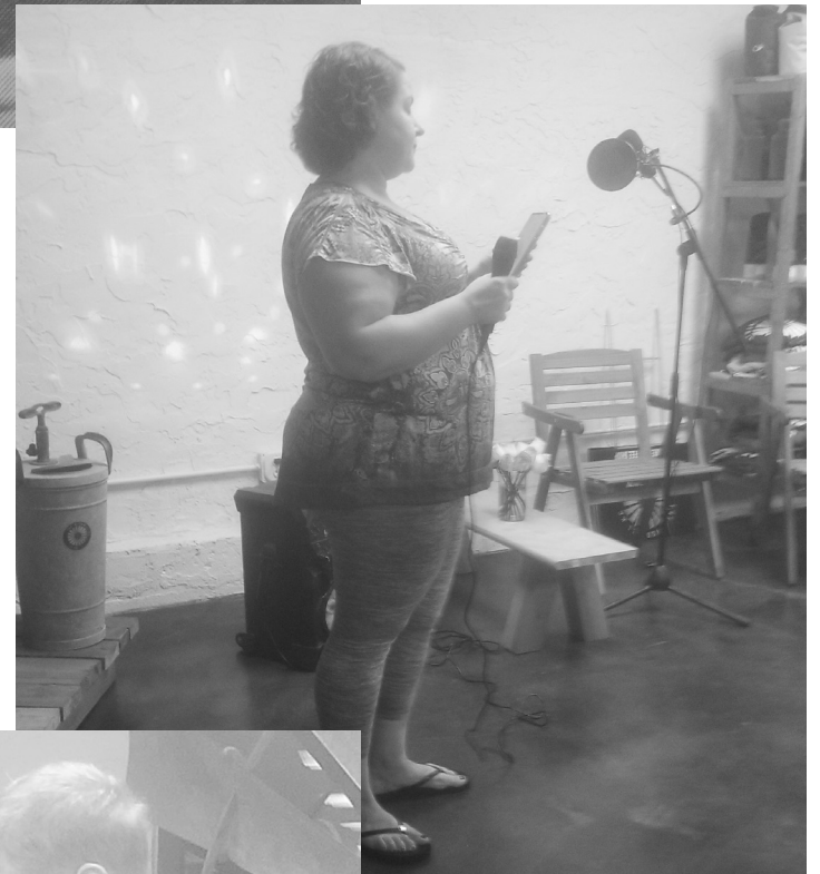
Entertainer at WindmillKC