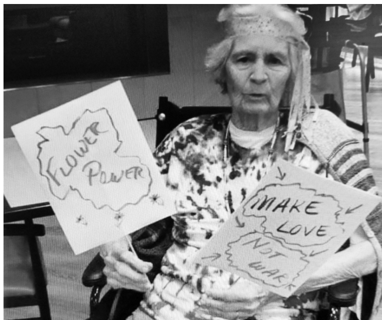
Does this hippie look familiar?