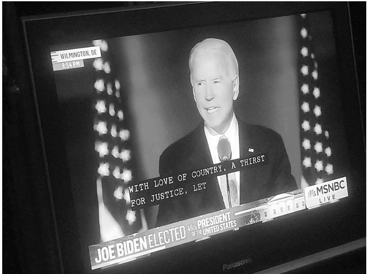
President-Elect, Joe Biden

Another television icon has gone after 36 years doing game shows. Alex Trebek, was 80 years old and passed away after battling pancreatic cancer for about two years. Canadian born, he sported a beautiful head of hair with a matching moustache that drew him to the public and the world of tv. Alex will be missed, but he fought hard and stayed with his hosting the game show of Jeopardy His last televised show will be shown on Christmas day, this year. As of this writing, a new host has not been picked. Nevertheless, it will not be the same without Alex Trebek.