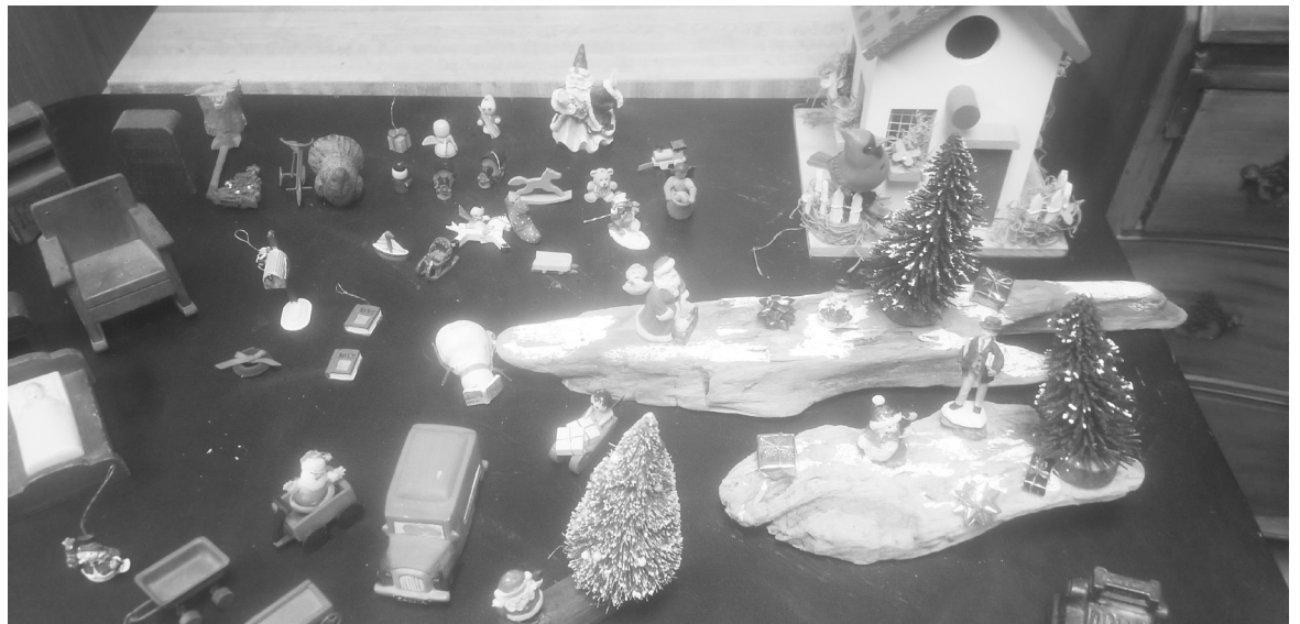
A miniature class might be coming at Turner Depot