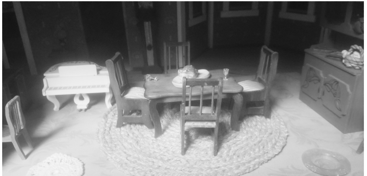
Miniature class in the future.