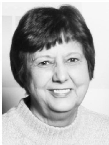
By Sharon Hoover

When I dropped off my last book and picked up a new one at the library, I received a notice that an adult (18 and older) winter reading program is beginning on December 1, 2020 and ending February 28, 2021. Something to recharge your batteries. Read six books to earn a KCKPL Mug and Charger Pack. Any reading counts - books, eBooks, audiobooks, magazines, graphic novels and more. Prizes delivered through curbside pick-up while supplies last. I received a reading log in my book. Sign up at kckpl.