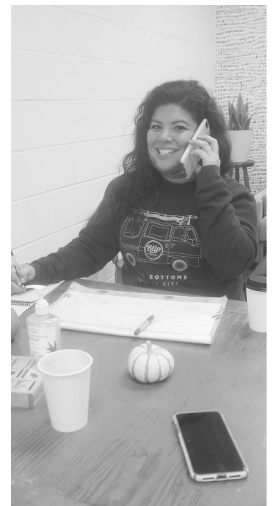
Busy lady in the new addition of Turner, Windmill KC.