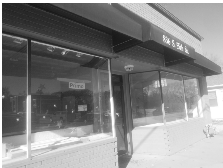
This photo shop is empty again on 55th Street.