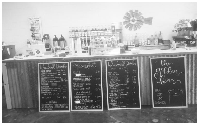
This little cafe has had its finishing touches on 55th Street.