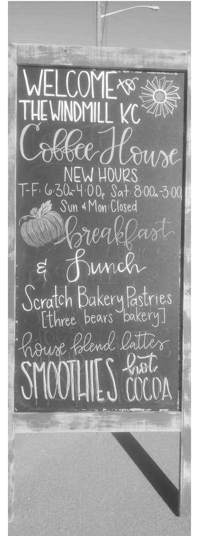
Outdoor sign of the newest addition in Proper Turner.