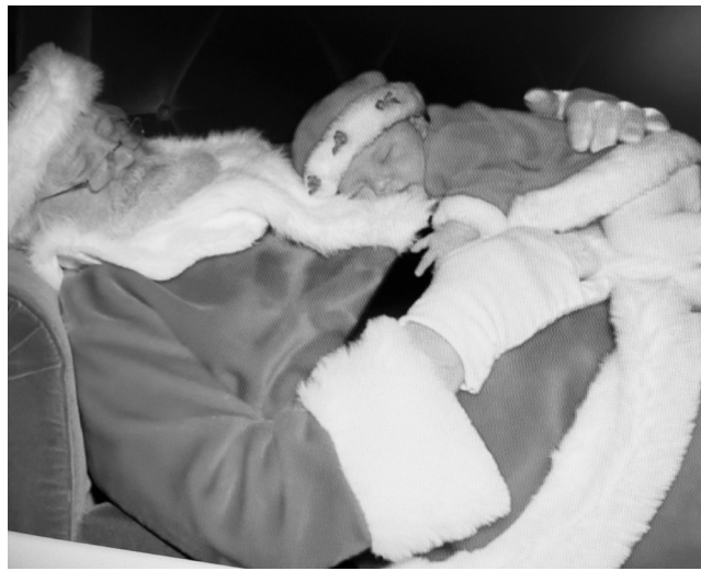
This is what happens after Christmas.

Places in Rosedale to shop: Three Bees assortment of gifts, coffee, eat. Rosedale Bar B Q — good bar-b-q, order online or catering. Strasser hardware — Everything you need for indoors or outdoors. Chixen KC — only place in town to buy chick burgers. Muffin and Bob — Children's books and cards.