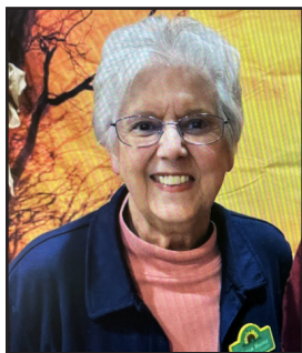
By Sharon Hoover

F irst, an update. The Turner Community Garden has 9 open plots for rent. Applications are at Turner Recreation's office, 831 S. 55 th , from April 1 until the May 1 deadline. Cost is only $15 for a